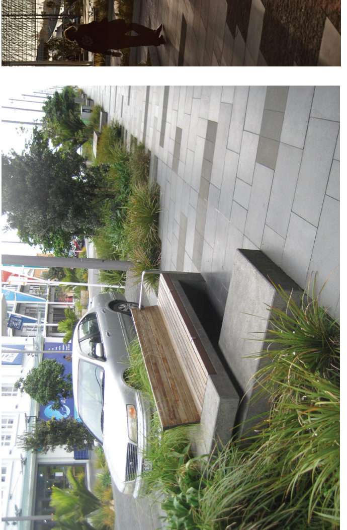
Stone pavers with varied textures, colors and sizes