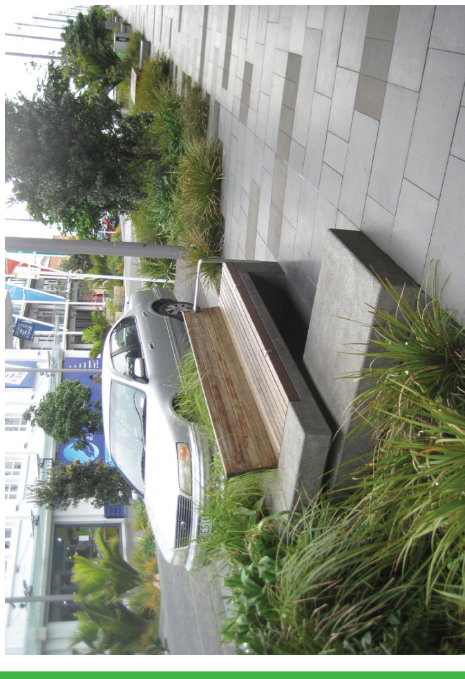
Stone pavers and built in benches